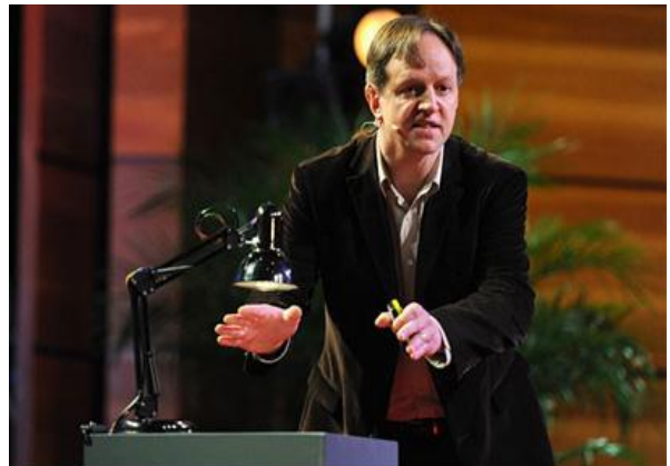
Prof Harald Haas demonstrates high definition video transmitted by the light from a table lamp at TED Global 2011 how we communicate

The advent of high-intensity, solid state LEDs (Light Emitting Diodes) are the foundation of this technology, and they allow to provide wireless communication solutions with virtually unlimited bandwidth within the visual light spectrum. Modulating light signals that communicate with lamps and equipment are embedded within the visible light generated by LED lamps. In addition to using less energy than conventional lighting, these devices, when placed throughout a building or geographic area, form a comprehensive wireless communication network which provides many services including illumination, communications, and security functions.